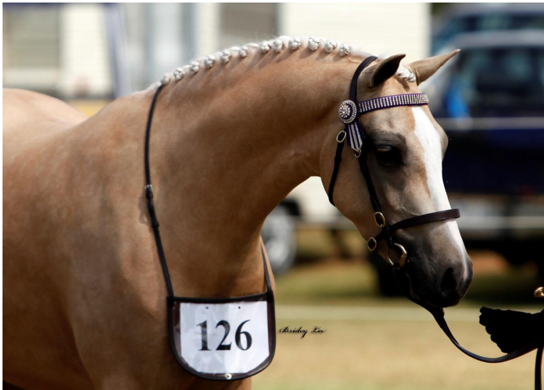
Murraydale Park White Diamonds – Diamond Award Winner

PS. PALLY'S ROCK! Just got to love them!!