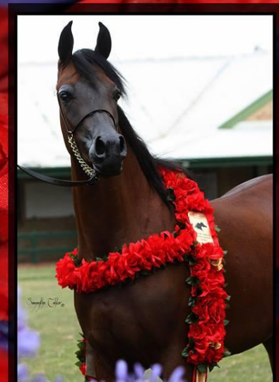
Dream Fever (Gal El Julien x The Palms Uptown Girl)

Exceptional Garlands available at affordable prices